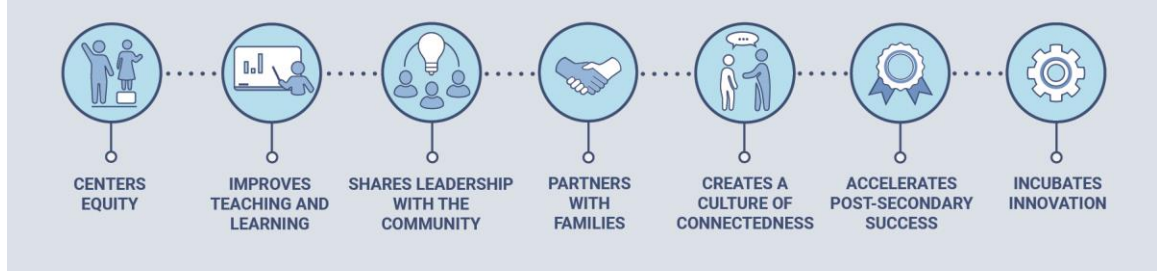
Figure 2. Seven reasons why a next generation of community schools will address inequality and transform education

1. Community schools serve as an equity strategy. A growing body of evidence shows that community schools increase equitable access to resources and whole child supports that create the conditions for learning and healthy development for all children, including students of color, English language learners, students from low-income families, and students with disabilities. Through their coordinating infrastructure, community schools cultivate cross-sector partnerships, <u>leverage existing resources</u>, and connect students and families to supports, such as physical and mental health care, to <u>close opportunity gaps</u>. Community schools in <u>New Mexico</u>—which were formed on tribal lands including Kha' p' o Community School, Nenahnezad Community School, and Haak' u Community Academy and established through access to resources and partnerships in Albuquerque, Las Cruces, and Santa